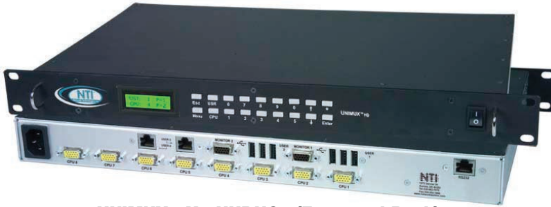
UNIMUX-4X8-UHDUC5 (Front and Back)

Up to four users can control 32 USB computers