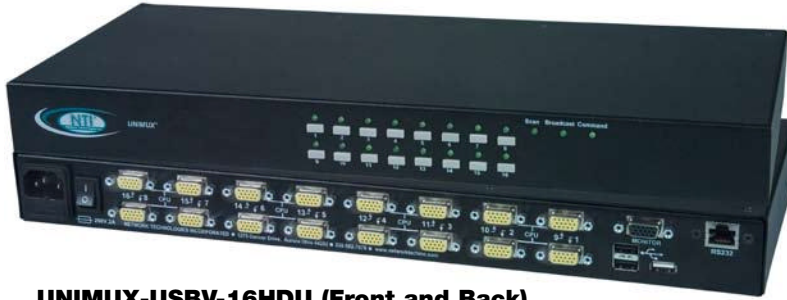
UNIMUX-USBV-16HDU (Front and Back)

Control up to 32 USB computers with one USB keyboard, USB mouse & VGA monitor