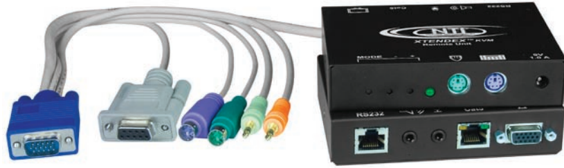
XTENDEX® ST-C5KVM2ARS-1000S (Remote and Local Units)