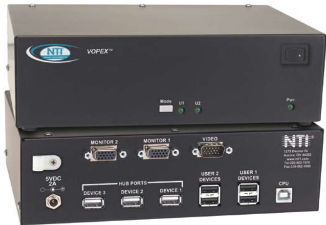
VOPEX-USBV-2 (Front & Back)

Allows two users to control one USB computer and connect three USB devices